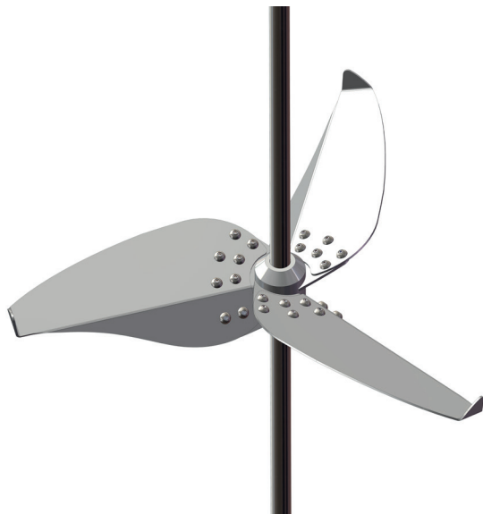
CYBERSLUDGE® Mixer: Mixing Element in detail

The CYBERSLUDGE® Mixing Element was developed especially for the harsh operation in waste sludge with high solids concentration and viscosities. It is made from stainless steel, coated carbon steel or according to the client's specification.