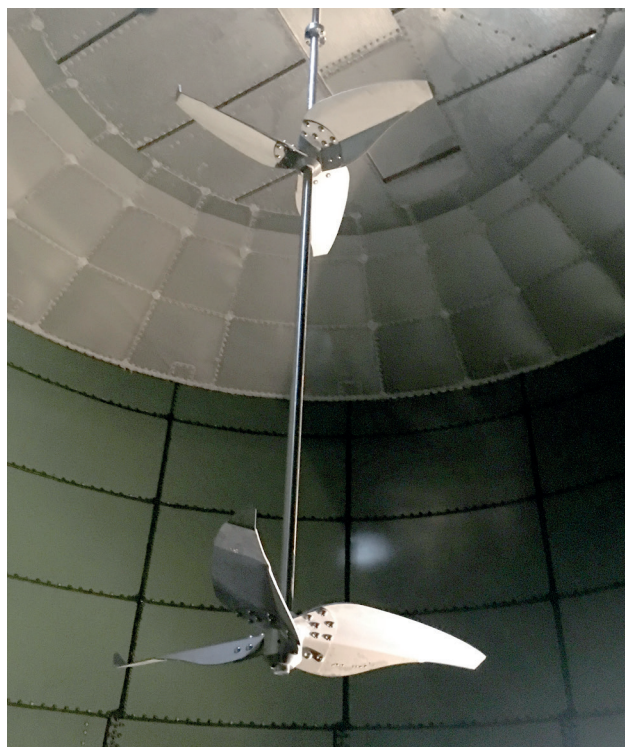
CYBERSLUDGE® Mixer: Ready for start-up

INVENT can supply the CYBERSLUDGE® Mixer with an automated water level control unit for water locks and/or variable frequency controllers to adjust the rotational speed and rotational direction of the mixer according to the operational scheme. For larger tanks and longer shafts a bottom guide bushing is available.